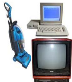
Electronics & Appliances