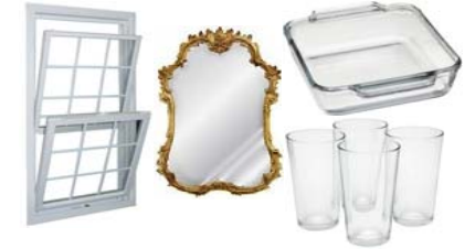
Glass - Windows, Mirrors, Cookware, or anything that is not a jar or bottle.