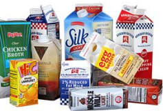
Cartons & Drink Boxes