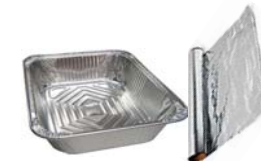
Aluminum Pans & Foil