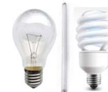
Light Bulbs & Tubes