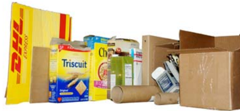
Cardboard - Various Types