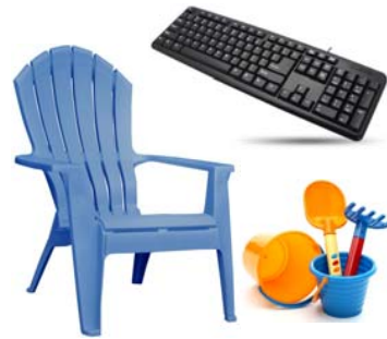
Plastic - Toys, Chairs, or anything that is not a bottle.