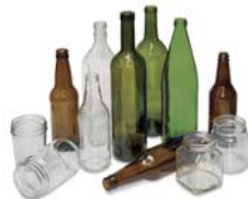
Glass Jars & Bottles