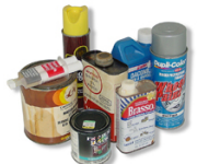
Paints & Chemicals